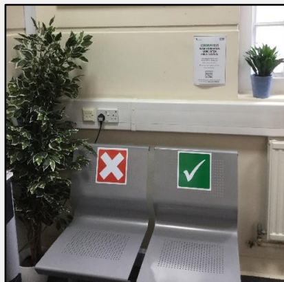
(Right to Left: Reception Entrance, Seating Area & Session Room)