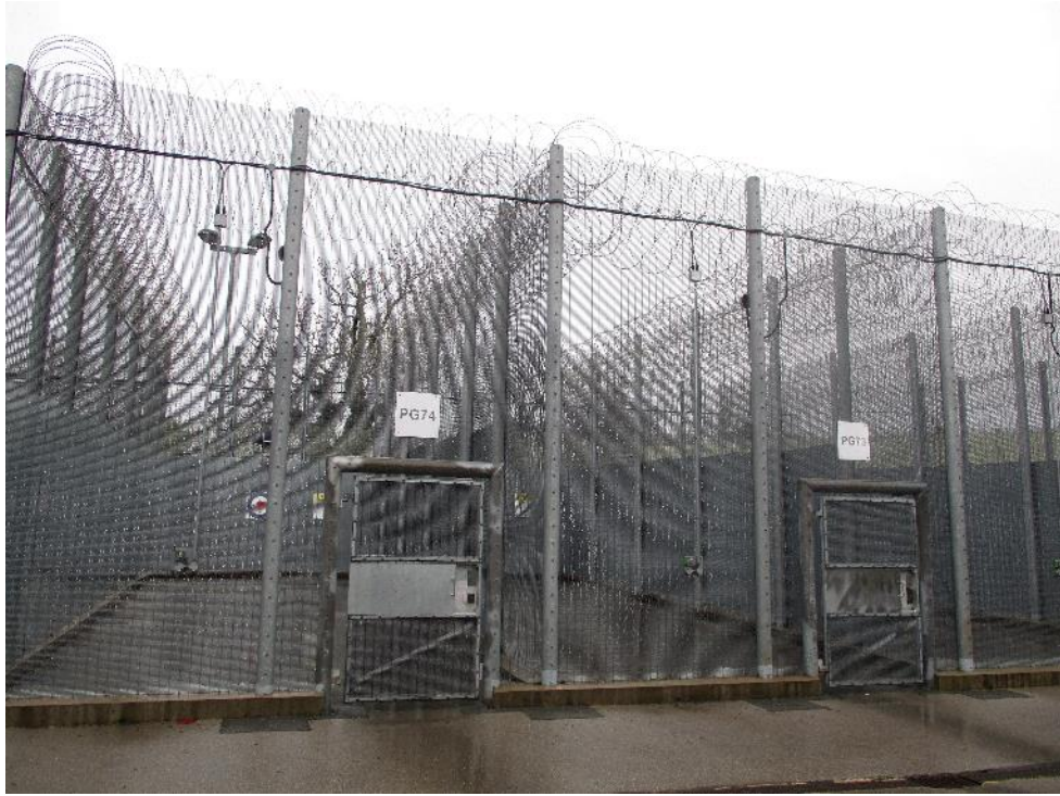
Anson exercise yard