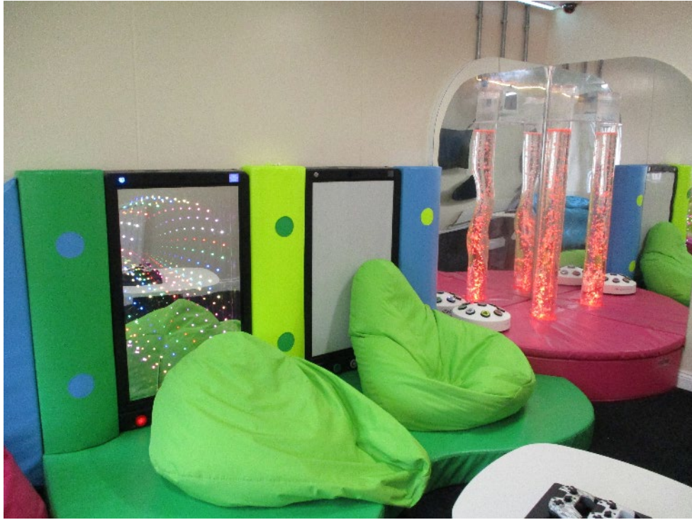
Sensory room Napier unit