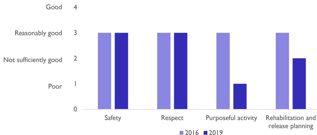
Figure 3: HMP Winchester (category C) healthy prison outcomes 2016 and 2019 5