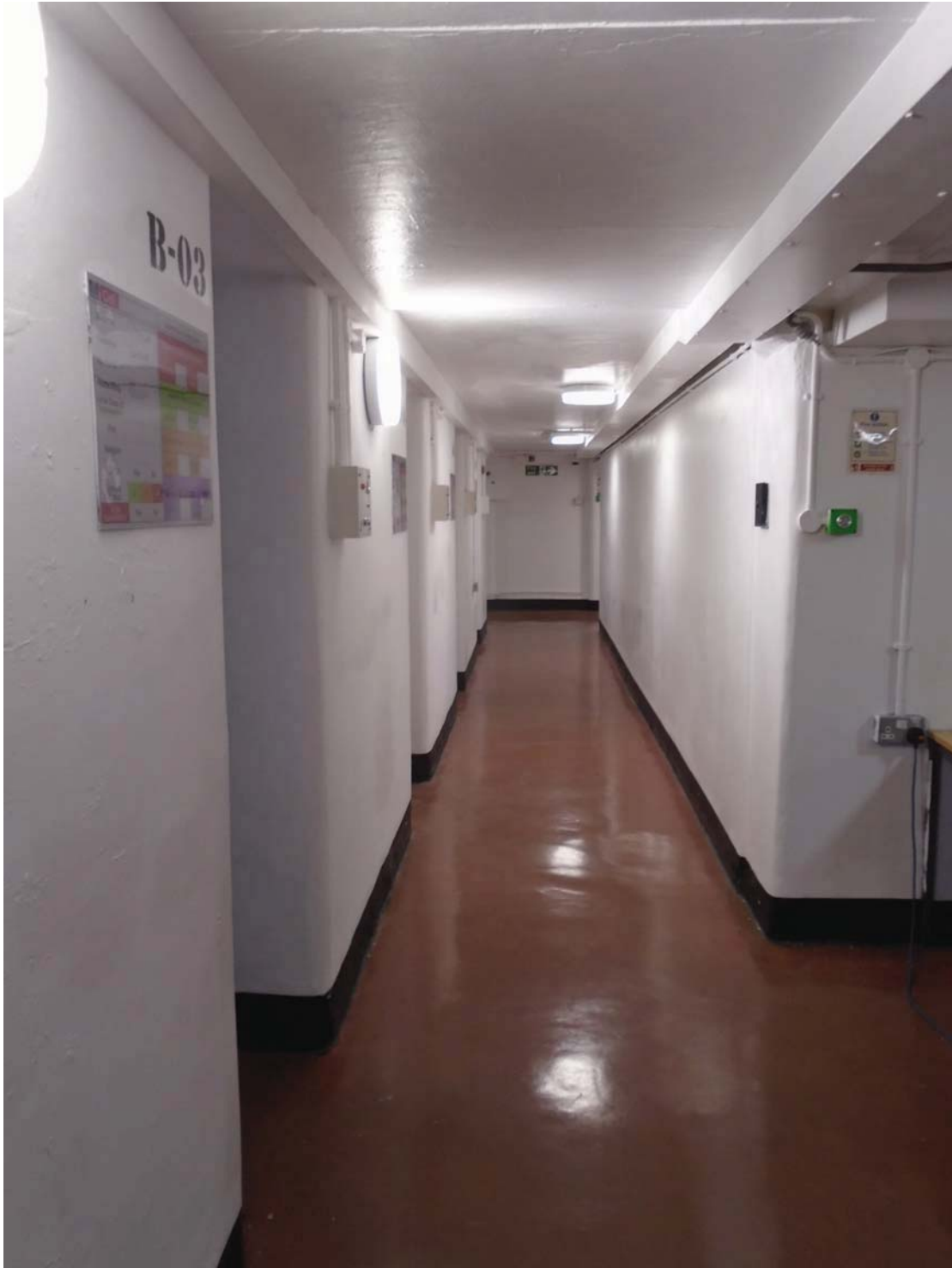
The refurbished segregation unit