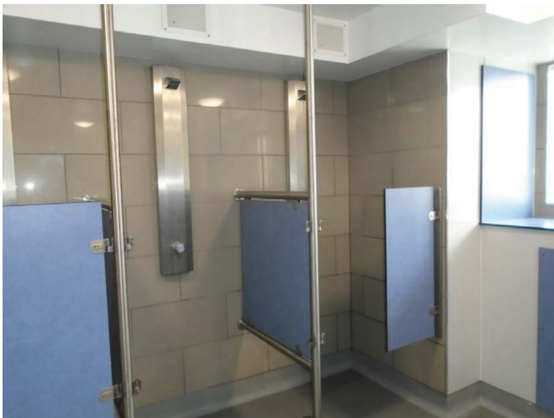
Progress on showers: D wing showers in 2019 following refurbishment compared with conditions in 2018