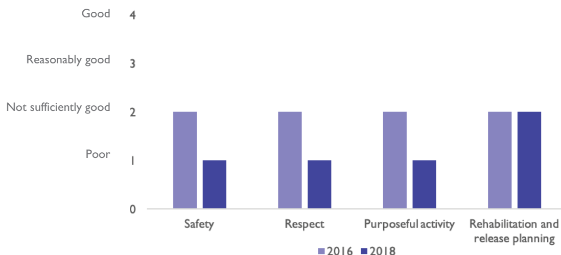
Figure 4: HMP Bedford healthy prison outcomes 2016 and 2018