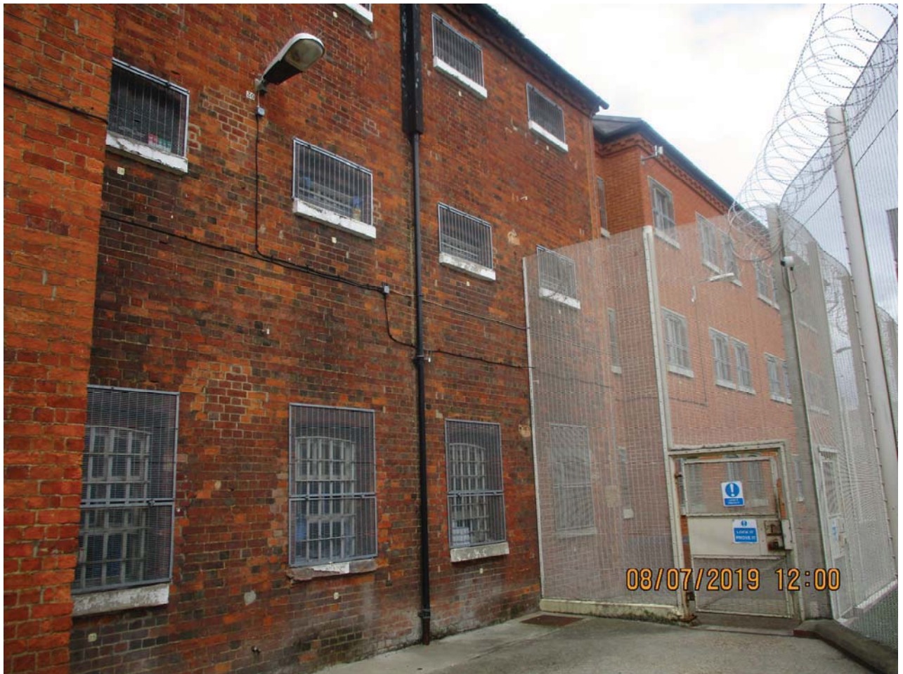
Outside areas now much cleaner