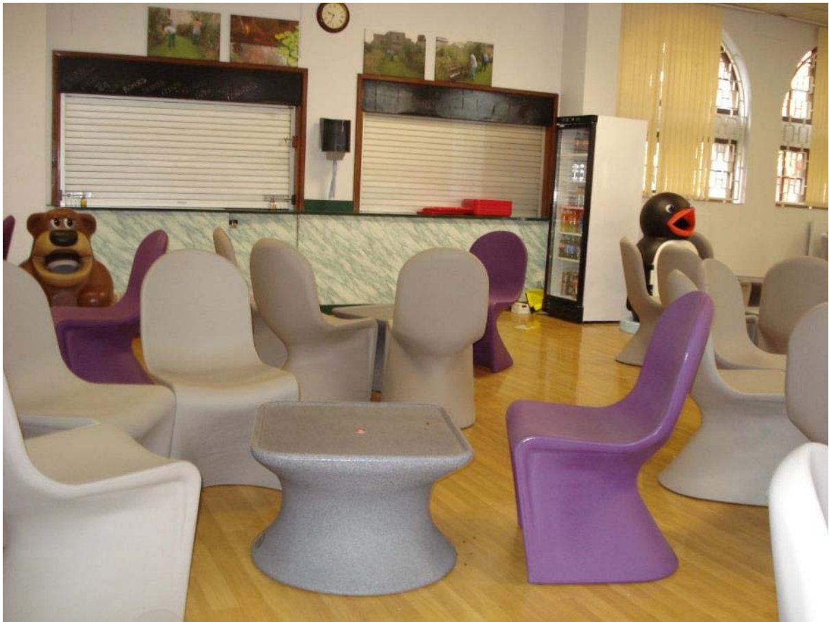
The visits hall