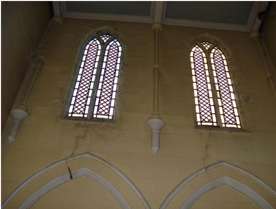
Water damage and structural defects in the chapel