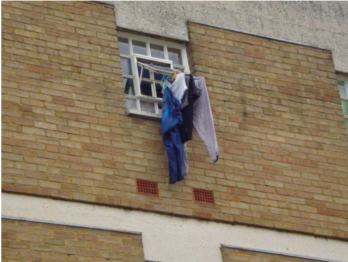
Prisoner's clothing drying outside cell