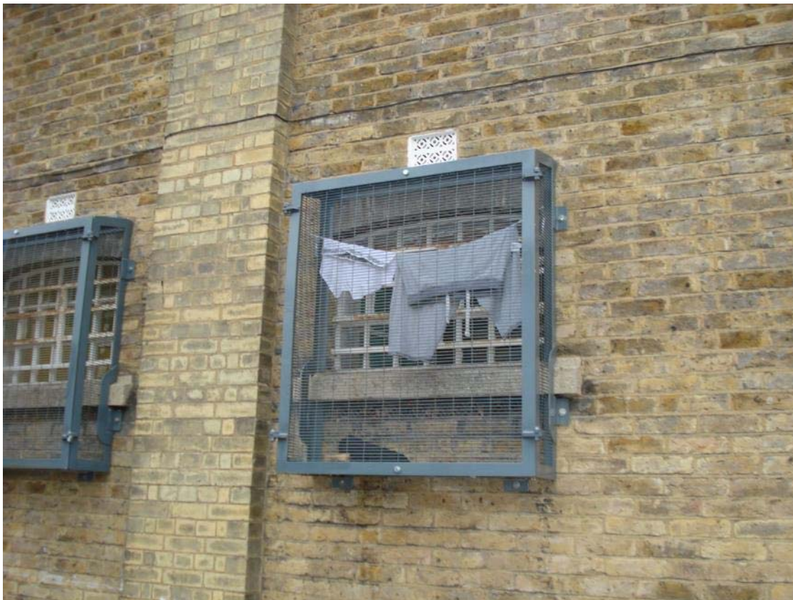
Prisoner's clothing drying outside cell