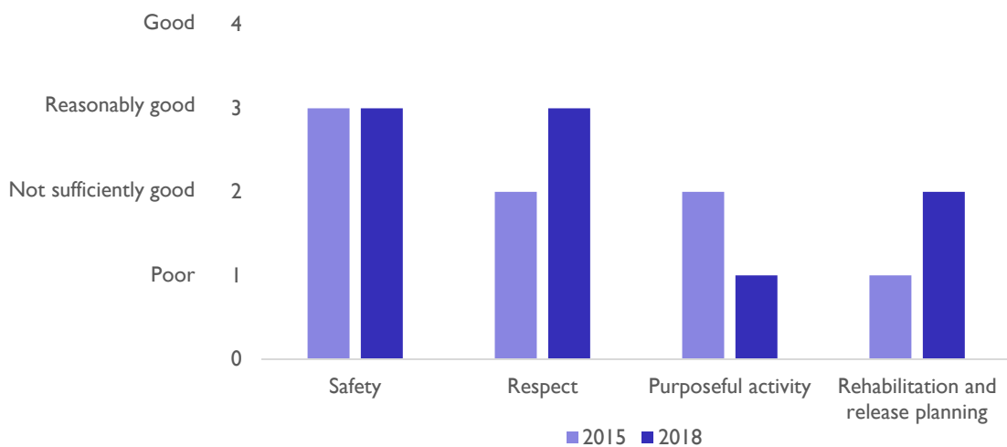
Figure 2: HMP Maidstone healthy prison outcomes 2015 and 2018 4