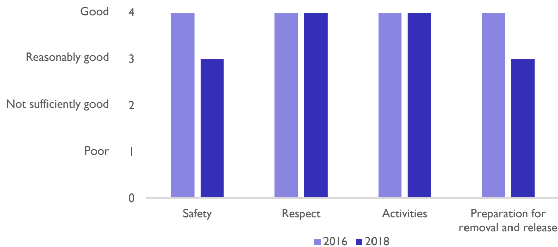
Figure 2: Pre-departure accommodation, Tinsley House Immigration Removal Centre healthy establishment outcomes 2016 and 2018 1